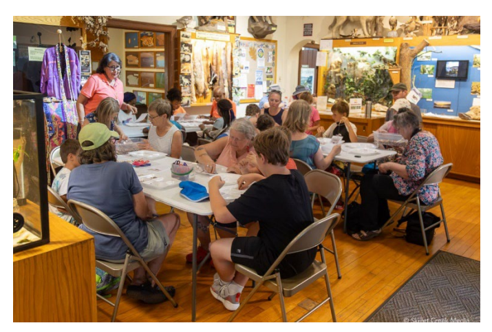
Bead workshop Photo by Derrick Mayoleth, 7.8.24