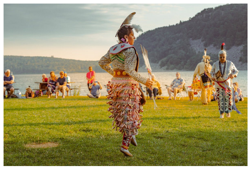
Skillet Creek Media Devil's Lake State Park area visitor guide Derrick Mayoleth (photographer), published July 8, 2024

The two NAM events were attended by approximately 200 for each market.