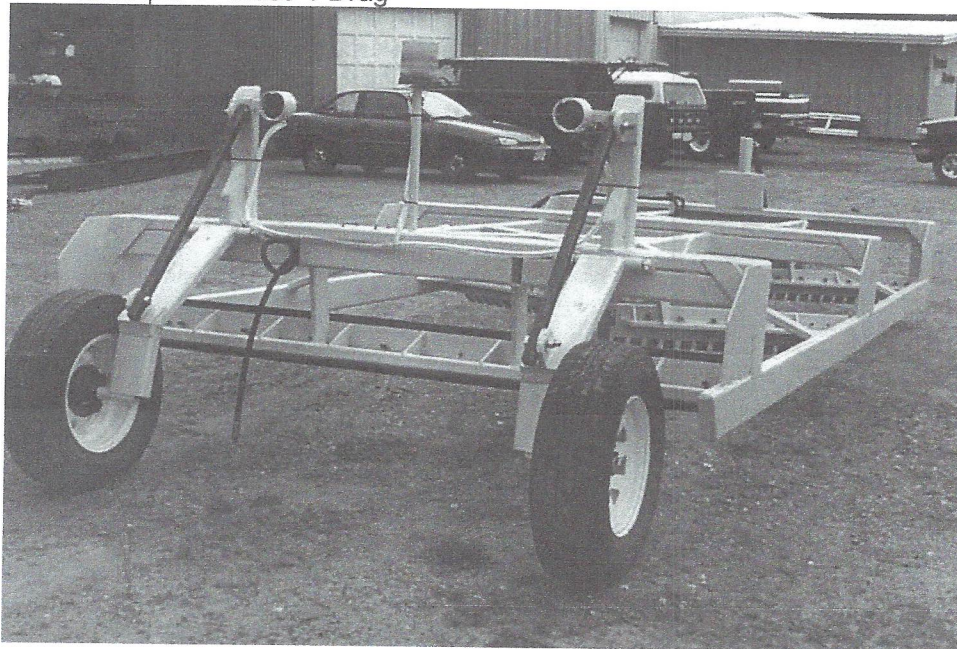
Example of Class 1 Drag