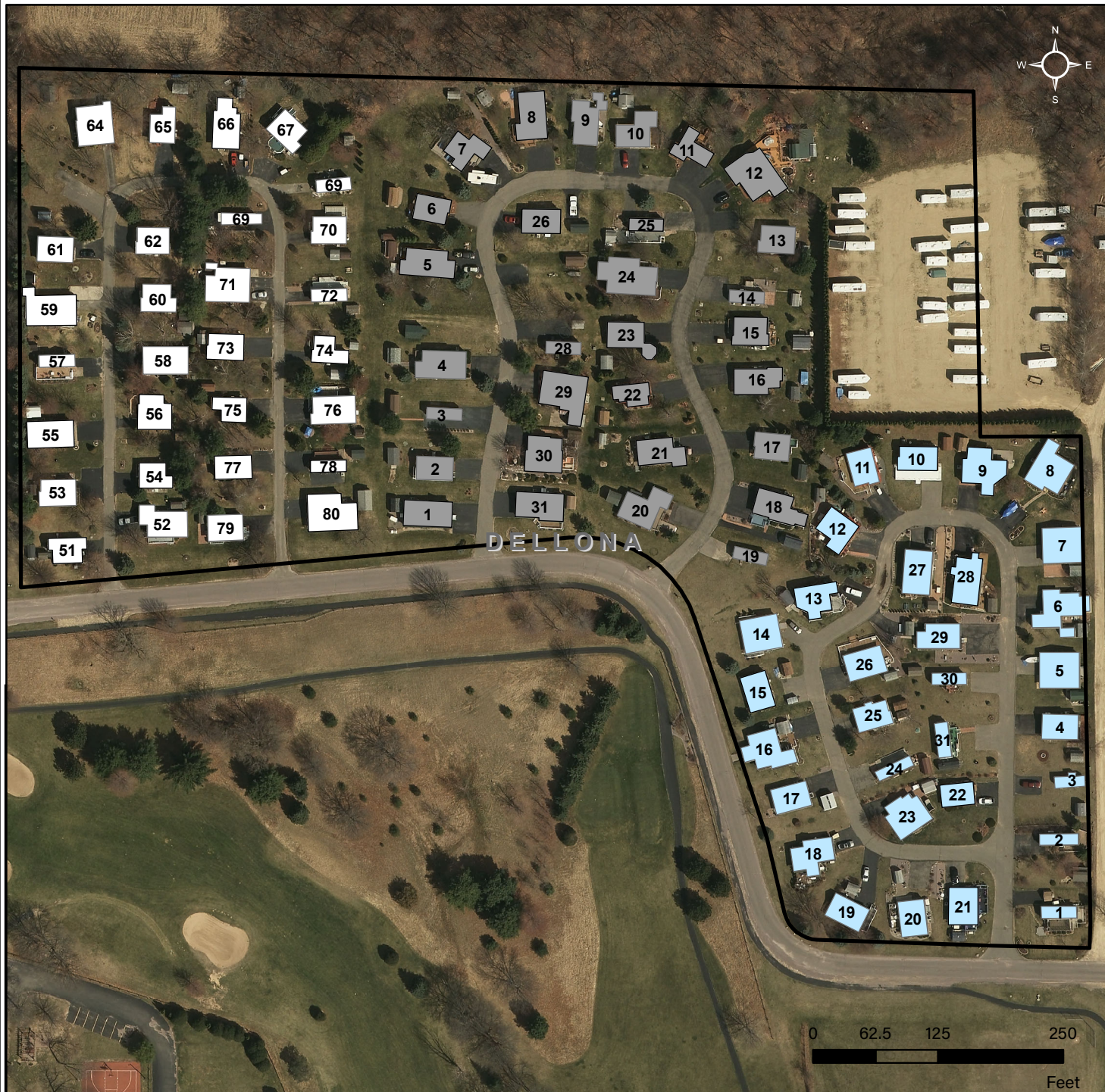
EXHIBIT A - Campground Overview